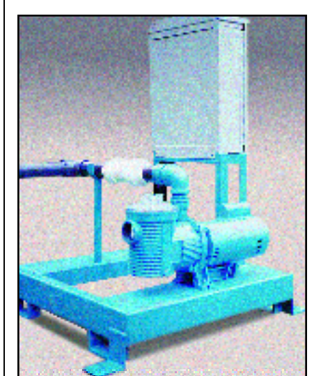
Custom Orders: Larger systems are available upon request. All systems may be customized to meet your needs.

TWT-BP-RC-6 Six-inch ByPass Deposit Control System Low Pressure Pump - up to 33,000 gallons High Pressure Pump -up to 55,000 gallons