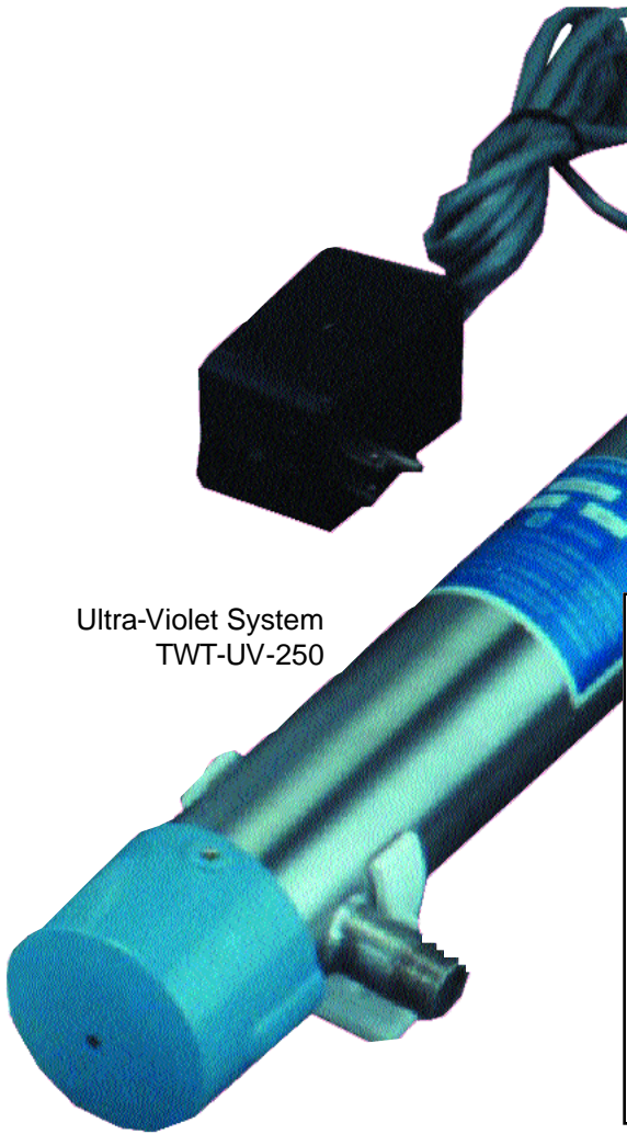
Ultra-Violet System TWT-UV-250