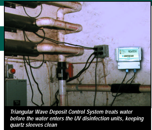
Triangular Wave Deposit Control System treats water before the water enters the UV disinfection units, keeping quartz sleeves clean