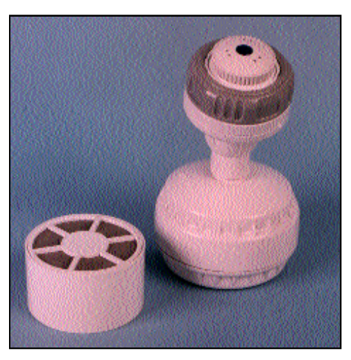
Grey Finish Shower Head Filter System with replaceable filter cartridge

TWT-SLM -RC Shower Head Replacement cartridge