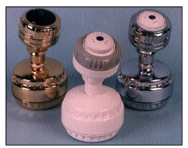
Shower Head Filter System TWT-SLM Grey Finish Shower Head Filter System

TWT-SLMC Chrome Finish Shower Head Filter System