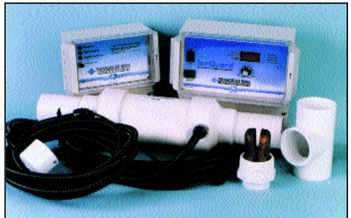
Triangular Wave Technologies Microprocessor Deposit Control Unit TWT-402, IonGuard Ionization Disinfection System TWT-ID-02 and a Factory Wrapped 2" Industrial PVC Reaction Chamber TWT-IRC-02

TRIANGULAR WAVE TECHNOLOGIES, INC. FLUID MANAGEMENT SOLUTIONS www.triangularwave.com