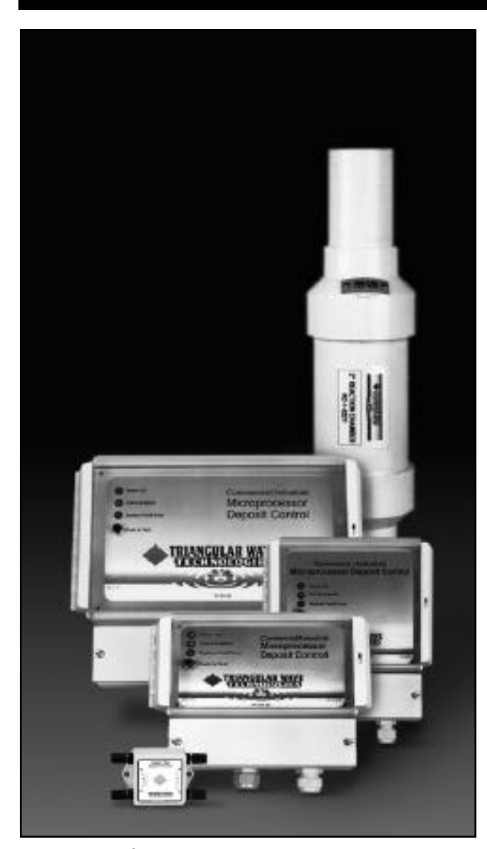
Upgrade Deposit Controllers if extreme hard water conditions exist

Unique, Scalable Systems For Every Need Configuring for extreme hard water conditions (TDS)